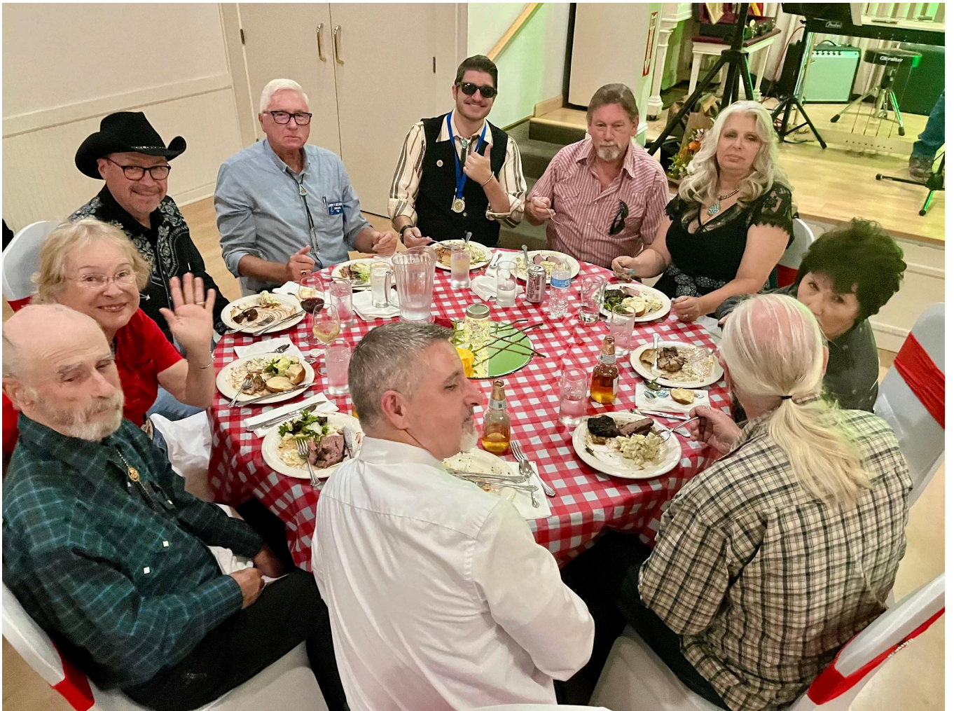
A bunch of Brothers went to DJ's Hiram at Orinda - western themed