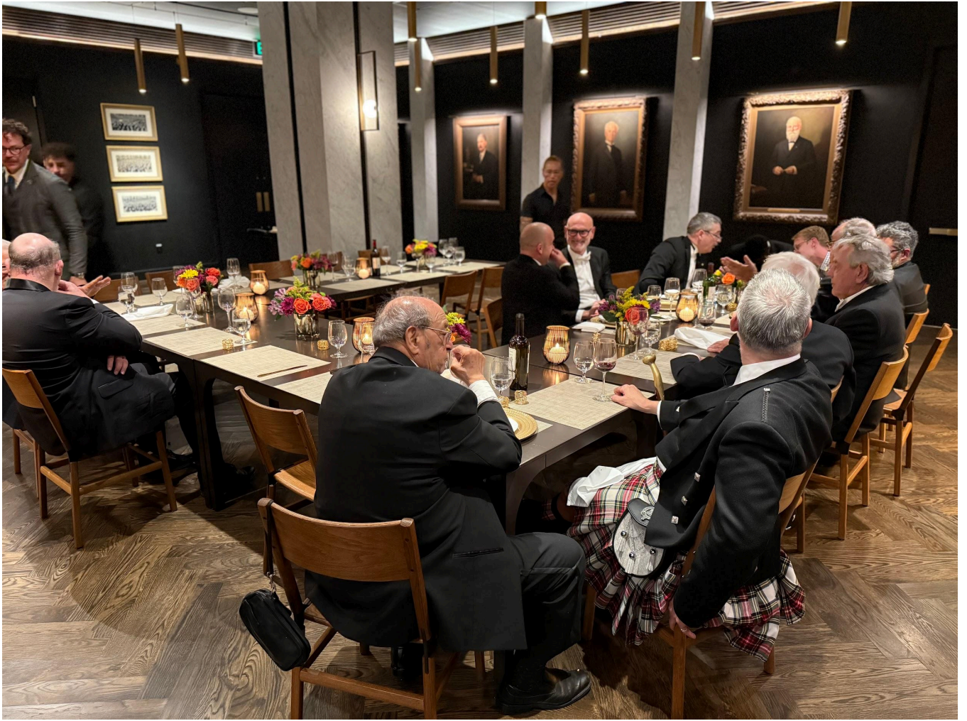
The dinner after seeing a French 1st Degree at Freemason's Hall