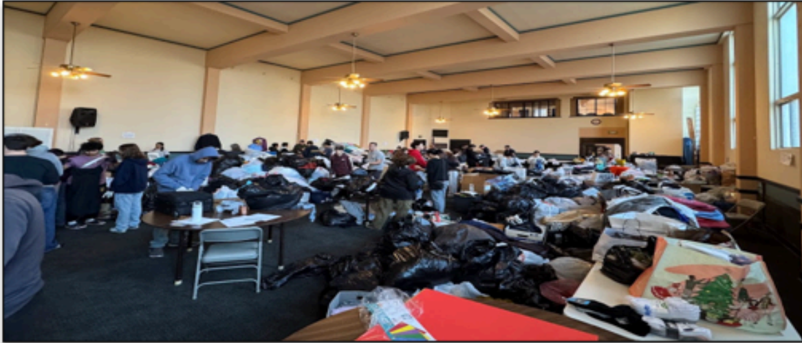
Whole bunch of donations at Martinez Lodge to be sorted. Many hands at work.