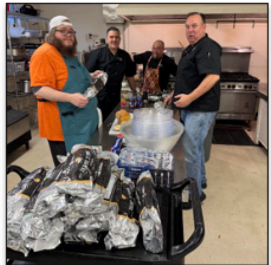
Crab feed crew hard at work!