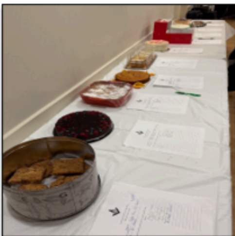
Officers baked goods for the auction.