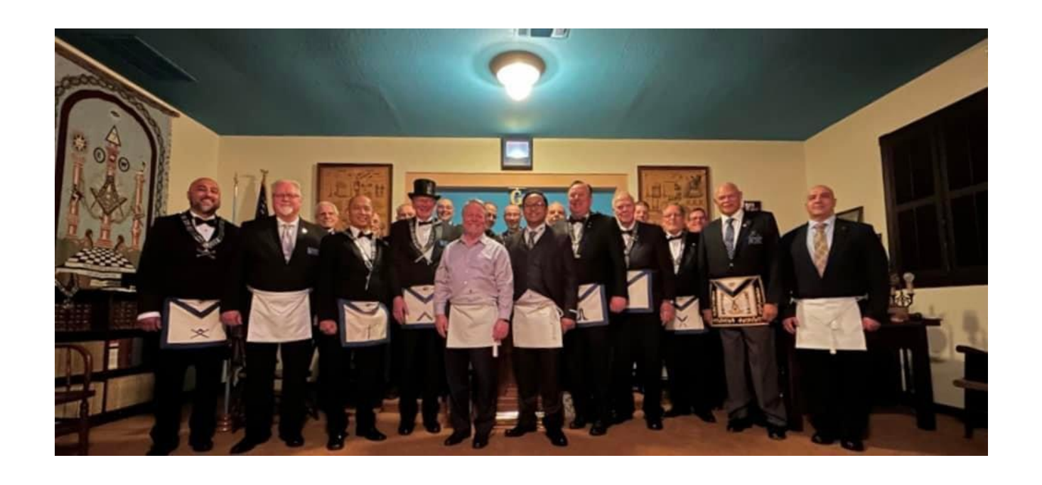
Entered Apprentice Traveling Degree Martinez Lodge#41