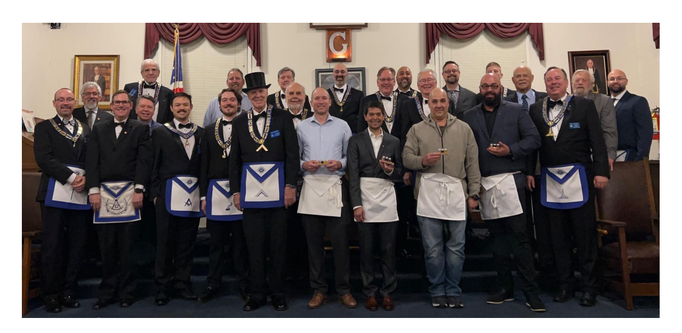
Quad 2nd Degree 2/27

Kaveh brought wages of Corn Wine and Oil for our new Fellowcrafts