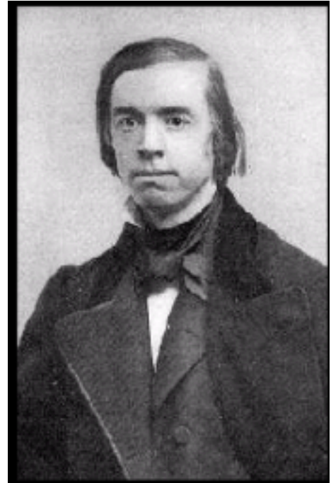
Thomas Starr King

As this will not be a tiled meeting, friends and family are welcome to join.